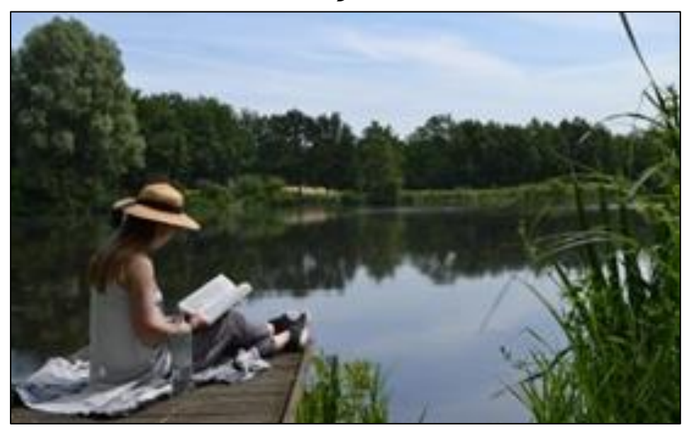
Turn the page for July/August Duty Schedule....